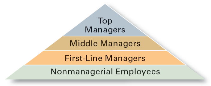
Figure-4: Hierarchy in Organizations (Example)

Szymanski & Parker (2003) argues that hierarchy is a logical sequence/order intentionally created between department and at different managerial levels to define their scope of work, power distribution within the organization and boundaries. It is always is ascending order. As hierarchy pyramid goes down the power will be decreasing. Strategic planning will be increased at the higher management levels. Apart from this, there is an internal hierarchy as well, which is implemented within a subsystem to maintain the power distribution within the resource. Hierarchy is also one of the important assumptions of General Systems Theory (GST), which is aimed to ensure rational, systematic and organized approach in order to do the tasks in organizational settings. The presence of organizational structures in organizations represent that there is some authority, responsibility structure within the system and HR department is the custodian of devising plans for authority and responsibility, hence it proves HR as a system, which is fulfilling this assumption. The following figure is representing the order of power and decision-making in a contemporary organization.